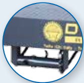
SIDE WINCH HEAD