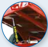
HYDRAULIC DUMPING KIT WITH DOUBLE EFFECT PISTON